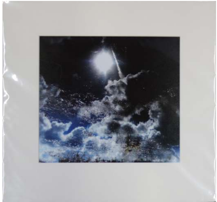
Photo Art, 41x39cm, mounted