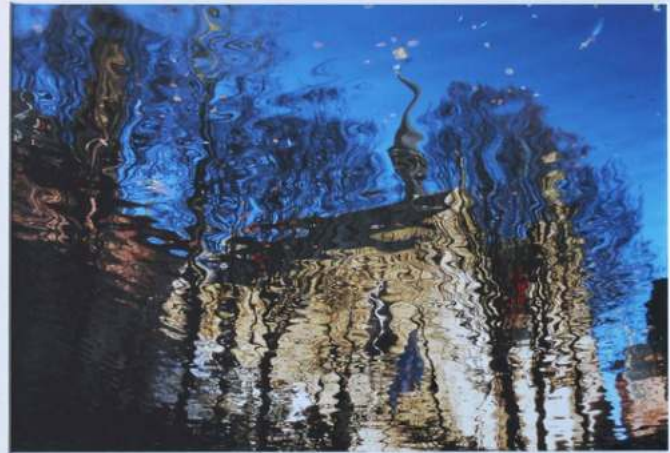
Photo Art, 37x48cm, framed